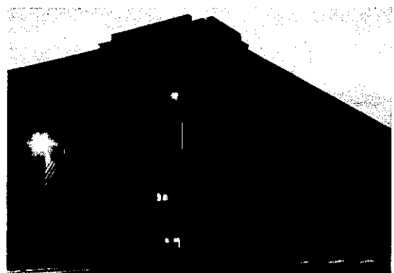
Raised Acrylic (Backlit)